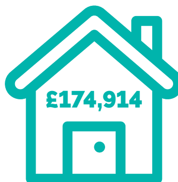
AVERAGE SIZE OF LOAN FOR FIRST TIME BUYER

Source: UK Finance Regulated Mortgage Survey, July 2019